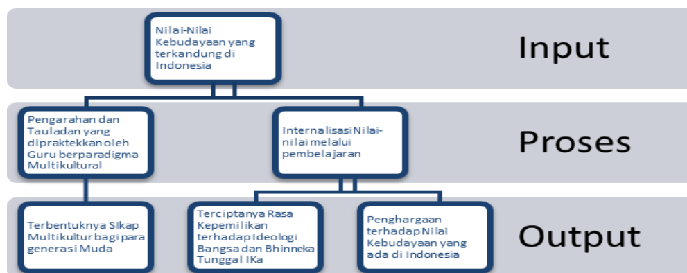
Fig 2. Indonesian Multicultural Education System Chart

As in the chart above, HAR Tilaar, although he simplifies the process a bit, he proposes the representation of multicultural education in Indonesia through the Civics learning process ( civic education ). The context in Indonesia is not always challenged from the social-cultural aspect. What is more complex than that is the problem of colliding religious attitudes and diversity in Indonesia. Therefore, like the previous decomposition, the authors assume that the ideal framework for thinking of a multicultural education system is like that of Gus Dur. The following chart can show how Gus Dur’s stance is, the ideal construction of multicultural education that should be implemented in Indonesia, especially regarding the clashes of religion, country, and culture that exist in Indonesia.