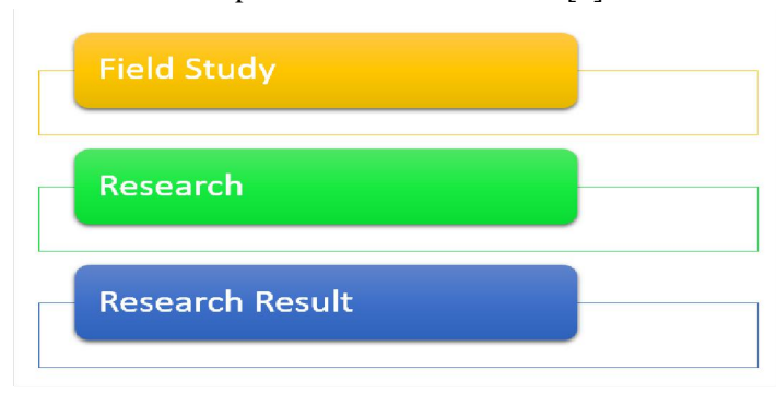
Fig 1. Research Method

The research method used in this research is to use quantitative methods by conducting field studies or conducting surveys to buyers who have made transactions in e-commerce media with the data, then the data will be processed so as to produce an answer that can solve the problem formulation. was appointed in this research research method and the picture can be seen below[1].