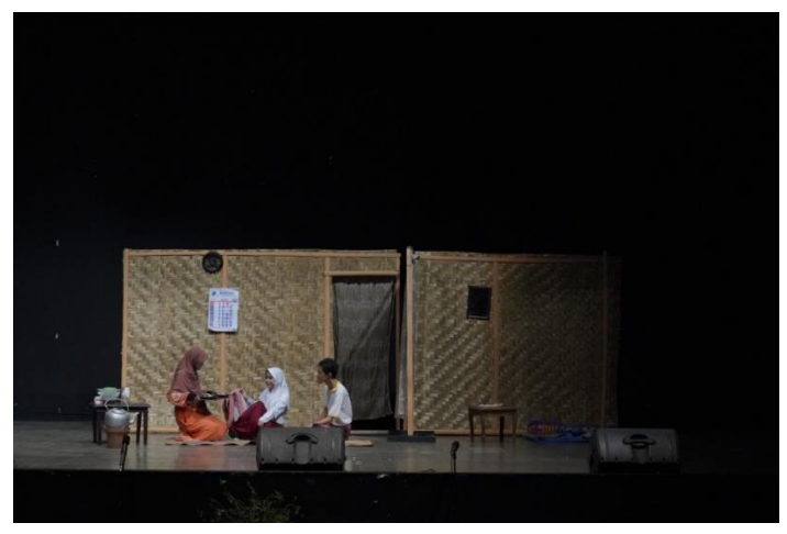
Fig 4. The atmosphere of the Sembagi Arutala dance drama performance by group 3.