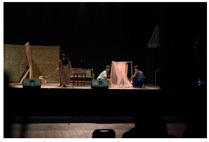
Fig 3. The atmosphere of the dance drama performance Anakku Na Burju by group 2.