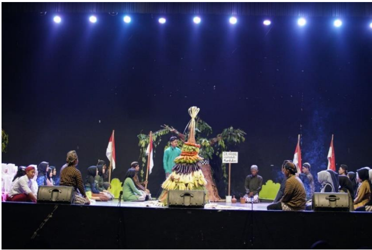
Fig 2. The atmosphere of the Wanakerti dance drama performance by group 1.

discovery of problems until the discovery of results. Discussions between lecturers and students have an impact that shows that the results of the work are getting better, and students are more focused and serious in the process. The lecturer gave directions to students to choose different titles, stories, and dialogues in each group so that one work with another has characteristics, uniqueness, and appears different from several other drama performances. The lecturer gives directions for the characters to show who they are by using dialogue and everyday language to make it seem natural and preserve culture. The definition of the product is very interesting; students can do their tasks with full responsibility. The following are photos that depict the atmosphere of each group's performance.