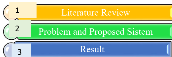
Fig 1. Research Method

Based on Figure 1 below, it will be explained that the research method used in this research in the first stage of the research method this time using the literature review method [20], which refers to previous research so that it can be the basic foundation for this research and then by using the proposed system, This system uses a proposed system in order to be able to update from an existing system and then produce a result that can be accounted for so that it can answer the research problem raised in this study [21].